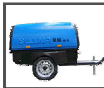
ABS-ASA composite canopy